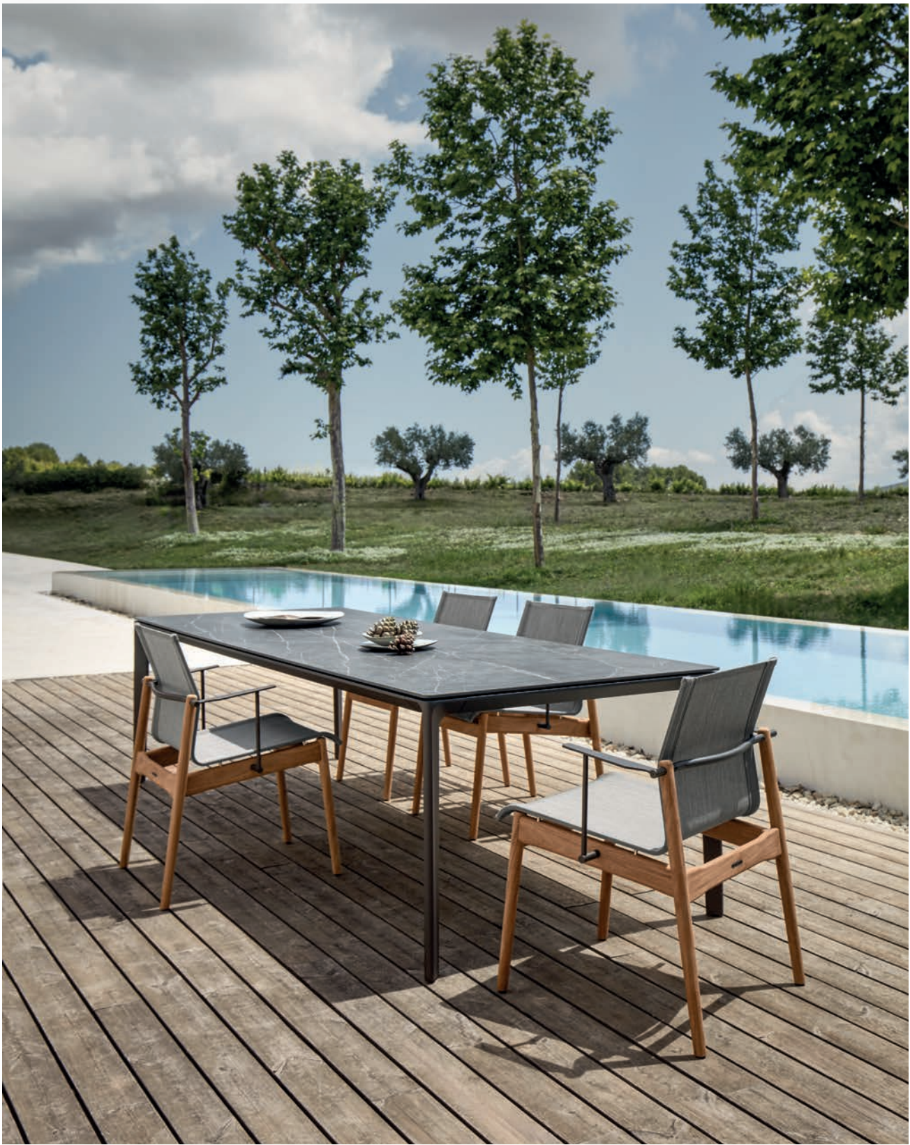
CARVER + SWAY TEAK